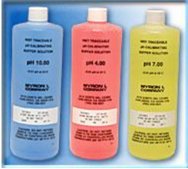
pH Buffer Solutions (PHBUFFER 4, 7, & 10)