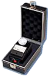
Carry Case (PTP)