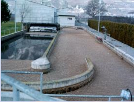
Fig. 2. Before treatment with heavy FOG.

Supply industrial water, wastewater, and enzyme products