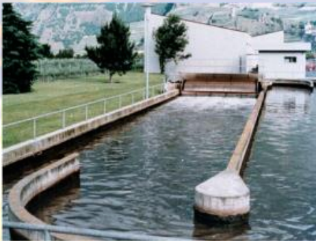
Fig. 4. Ongoing treatment with FOG control.