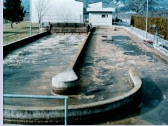
Fig. 3. During treatment with reduced FOG.